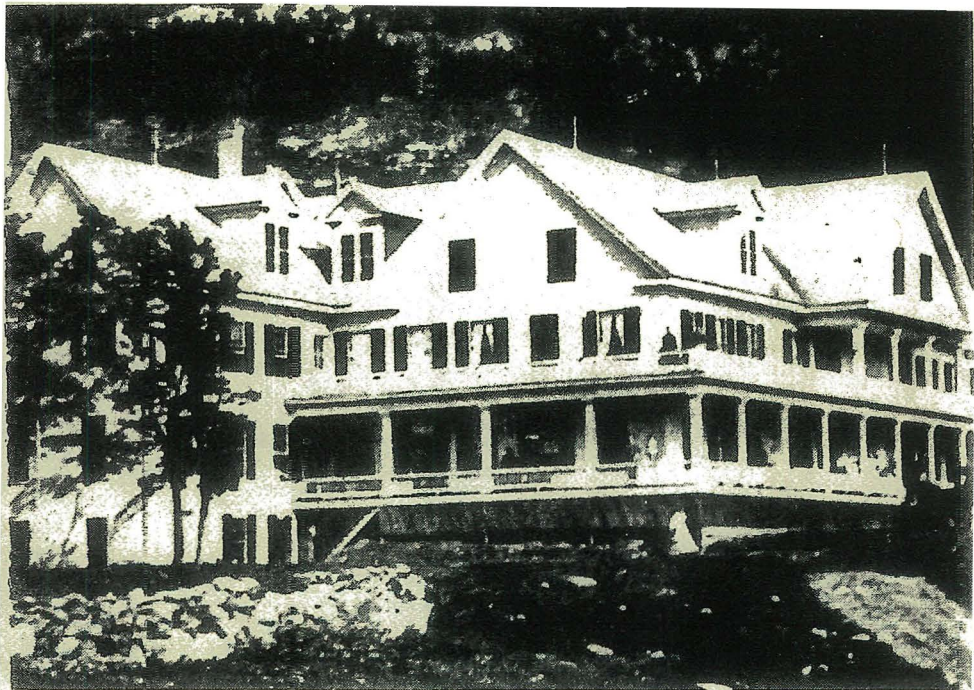
Winslow house on Mt. Kearsarge First Town House