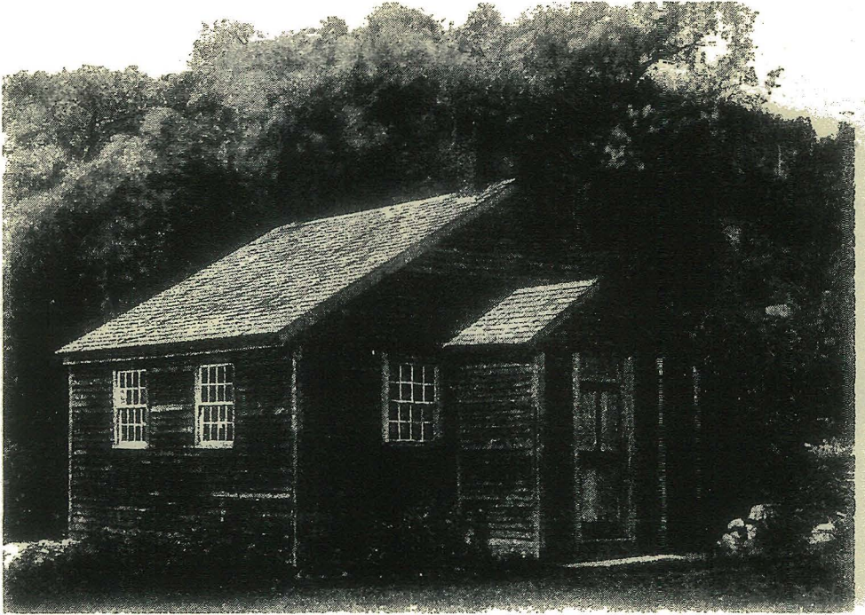
North Road School (built in 1812)

First Church — Union Meeting House Mail Coach at Wilmot Flat general store (where Soldiers' Monument now stands)